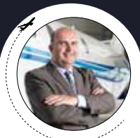
by İbrahim Sünnetçi

The latest data from the International Air Transport Association (IATA) shows impressive growth in the global air cargo market in 2024, driven by strong demand and a favorable operating environment where airlines moved more air cargo than ever before. The growth in the global air cargo market in 2024, as reported by IATA, indicates that the demand for air freight remains robust.