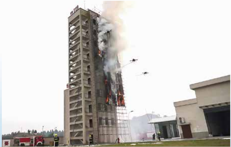
The first live fire drill for high-rise fire fighting drones were held in Dazu, Chongqing, April, 2020

operation. Although firefighting aircraft or upper segment UAV systems are an important option for large-scale fires, experts believe that expensive systems are not really necessary in order to effectively respond to fires that are low or moderate in severity, saying that reaction time is more important than quality, in terms of not needing to capture high resolution videos or images in order to react decisively. The real-time delivery of critical information to fire units can be conducted with more cost-effective drone systems. Drone capture and relay of critical information such as fire character, fire density, smoke emission, spread rate, and direction and intensity of the wind in a medium-sized region can be conducted without expensive higher resolution images and videos, which is more advantageous in active fire management and for department budgets as well. On the other hand, in countries such as China,