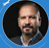
by Cem Akalin

Military and commercial multipurpose drones are proliferating worldwide. They are active in areas where the use of manpower is often inadequate and in areas that simply are incapable of access otherwise. Drones handle a variety of scouting and operational duties due to their precision and capacity to achieve highly efficient and cost-effective results, especially in hazardous areas. In military operations drones are utilized in a wide range of activities, from Nano class to the Strategic Class at high altitudes for the purpose of reconnaissance and surveillance, detection, tracking and attack. Various drones that are active on the civilian side have now become the trusted wingmen of many backpackers and travelers, capturing high resolution wide-angle fascinating footage and images. On the commercial side, autonomous drones have become an influential alternative in air cargo transportation (Google, amazon, etc.) in many regions where transportation is a