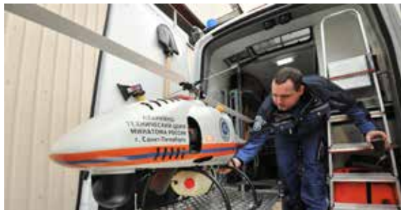
Preparation of an unmanned helicopter to a two-hour flight in the area of radiation accident radiation measurement, photography and videograph

In case of a dam burst or unforeseen floods, especially within the scope of pre-disaster precautions, fixed-wing and multi-rotor UAV systems (operative, tactical UAV systems) perform tasks to determine the existing state of a dam, for example the proactive identification of areas that are at risk of rupture. Locations on the dam that