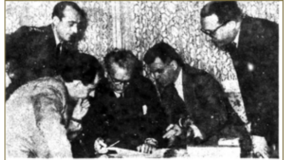
Theodor Von Karman (ortada g'ülükü) dün ilim adamlarıyla görüşürken

Again just before the war von Karman, who was technical advisor to the